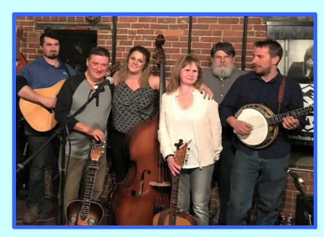
Back Woods Road (ME)