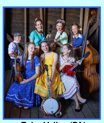
Echo Valley (PA)

** FIELD PICKING WELCOME ** Fishing & Swimming.